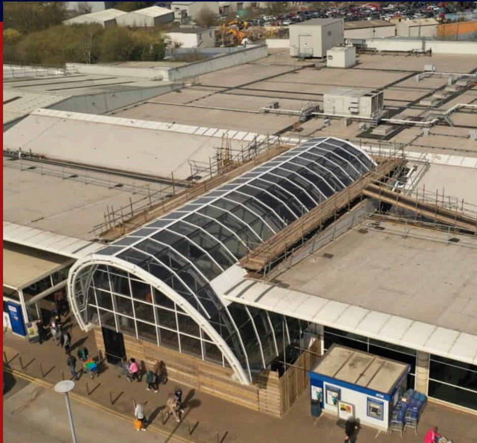
WALKWAY AROUND ENTRANCE