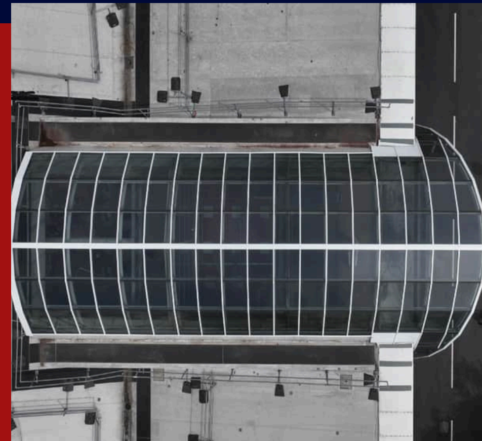
AERIAL PERSPECTIVE OF COMPLETED ATRIUM