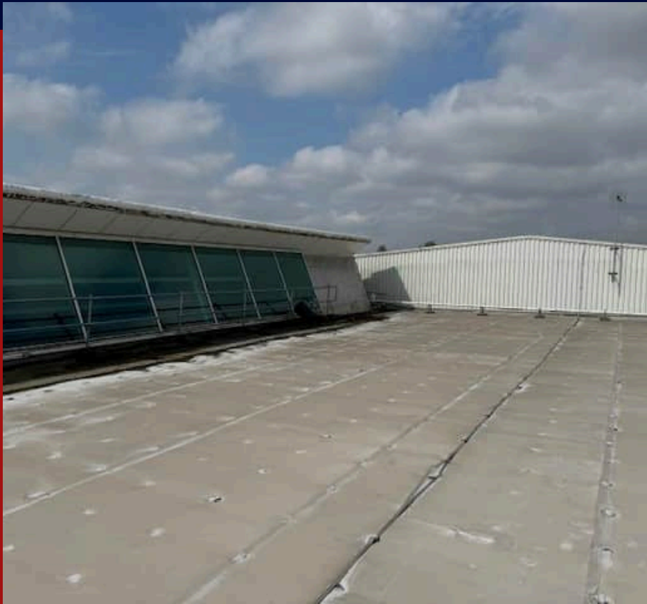
OPPOSITE SIDE OF OLD ATRIUM