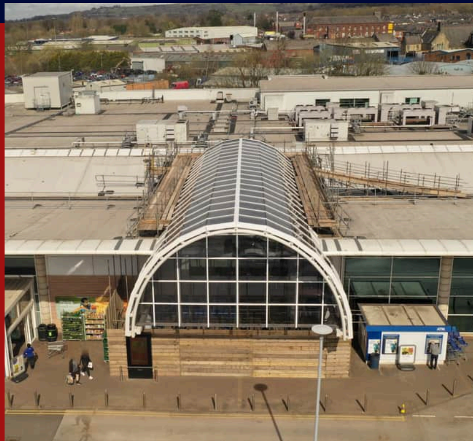
ONGOING ATRIUM INSTALLATION