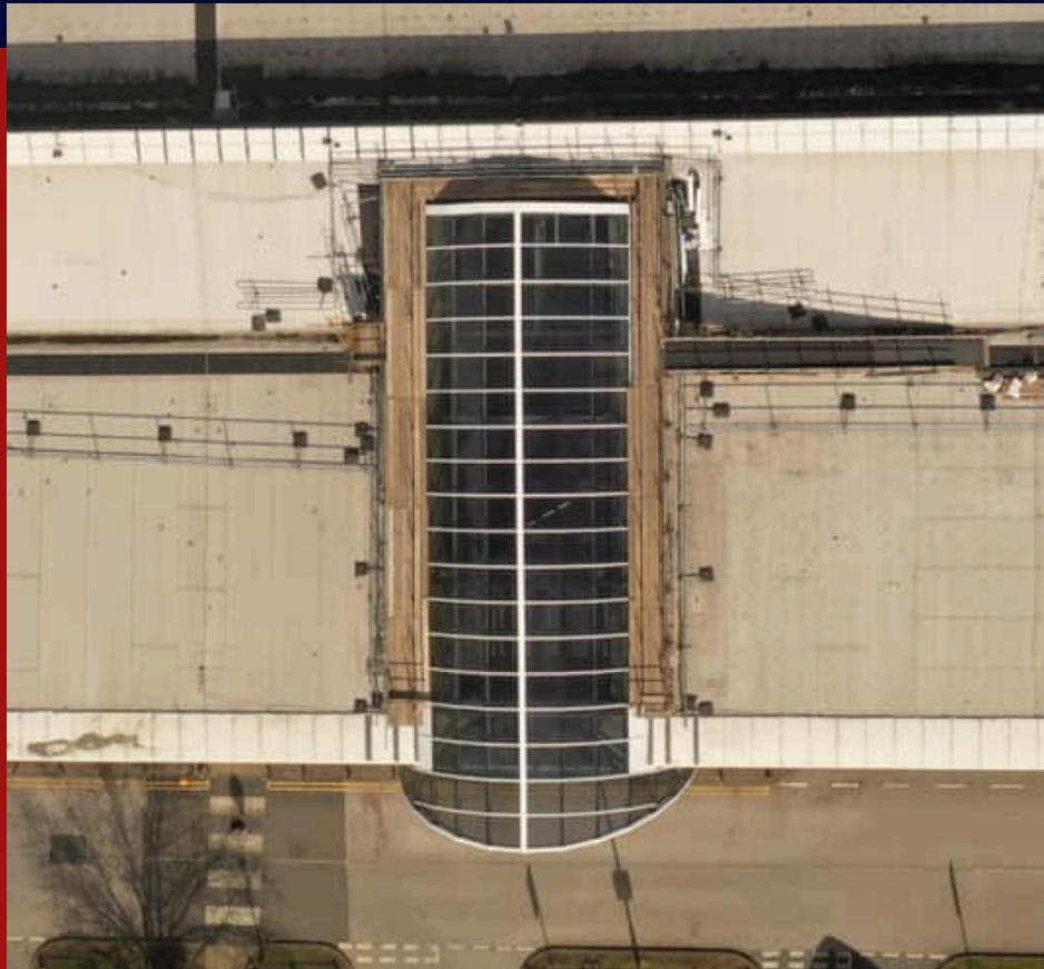
OVERVIEW OF WALKWAY