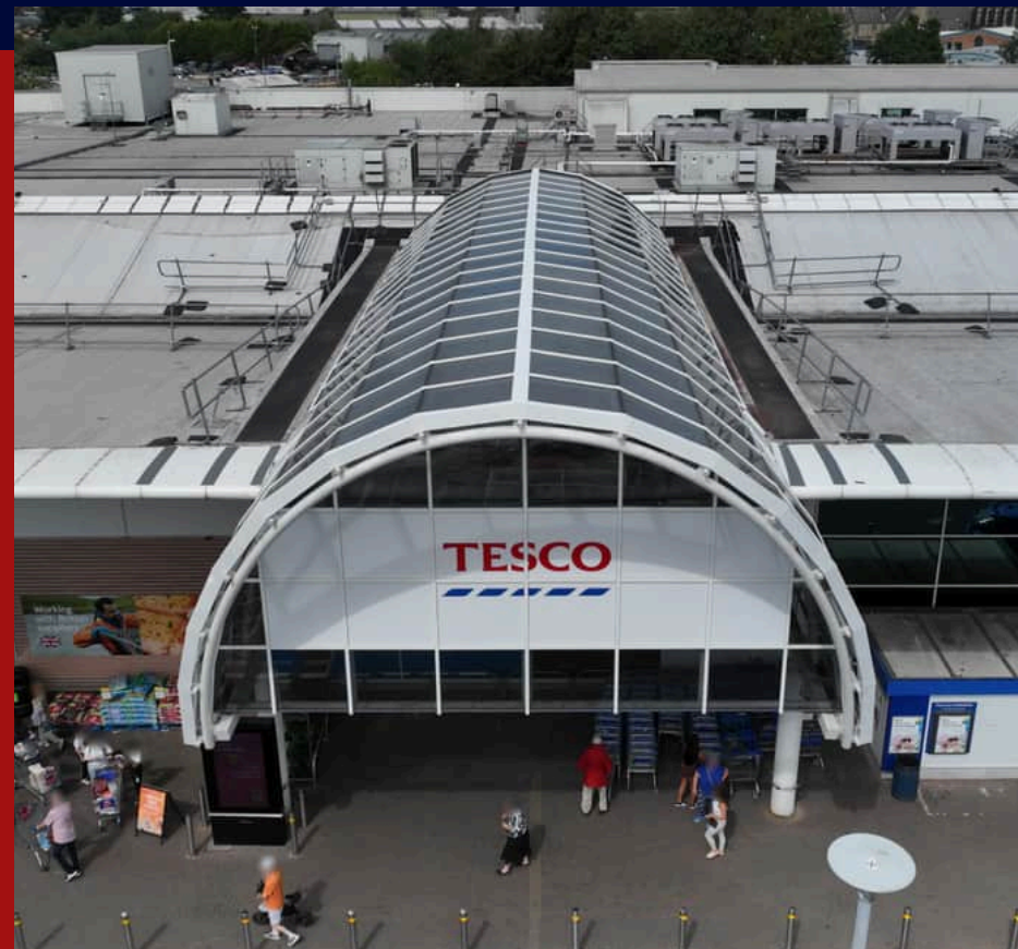
INSTALLED GLAZED ATRIUM AT FRONT OF TESCO BURY STORE