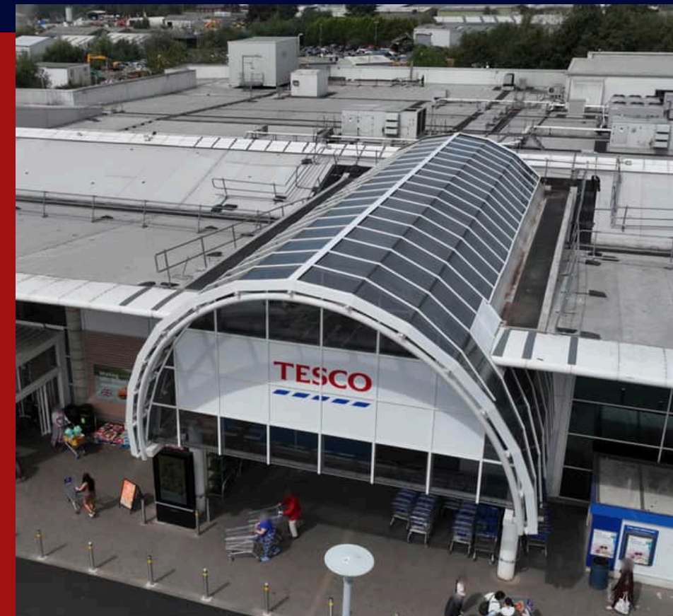
COMPLETION OF NEW ATRIUM