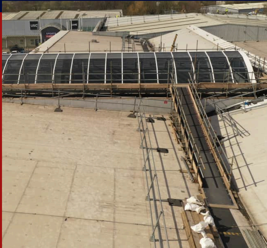
SIDE VIEW OF WALKWAY