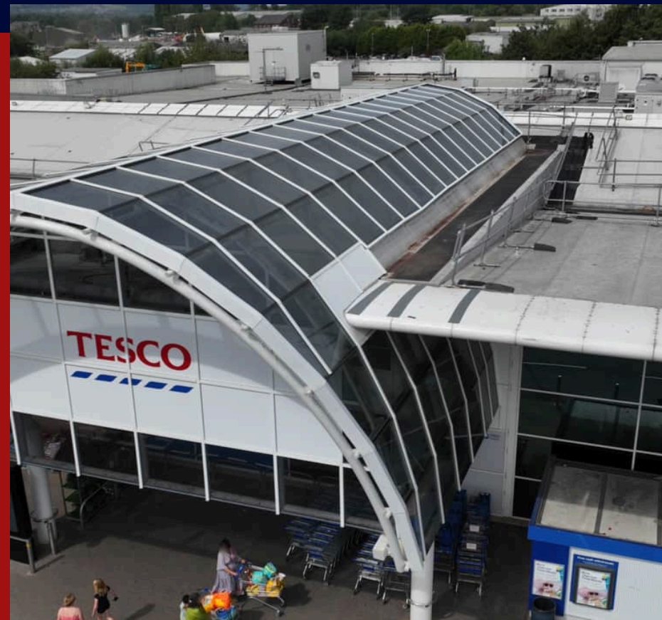
FRONT OF STORE WITH NEWLY INSTALLED GLAZED ATRIUM DISPLAYING TESCO LOGO