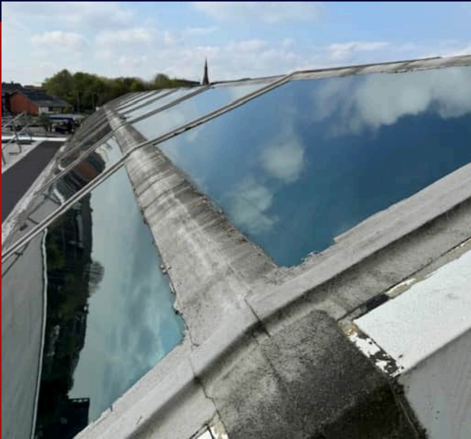
CLOSE-UP SHOWING AGED GLAZING