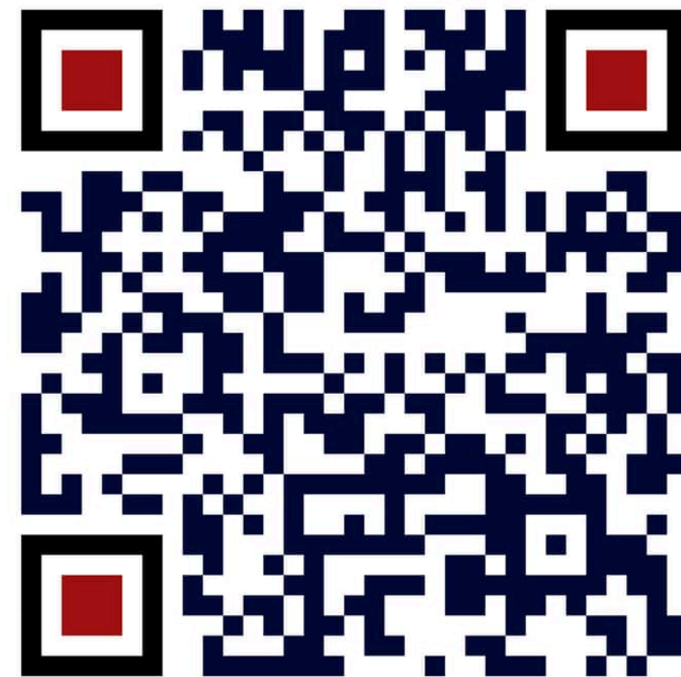
SCAN QR TO VIEW PROJECT