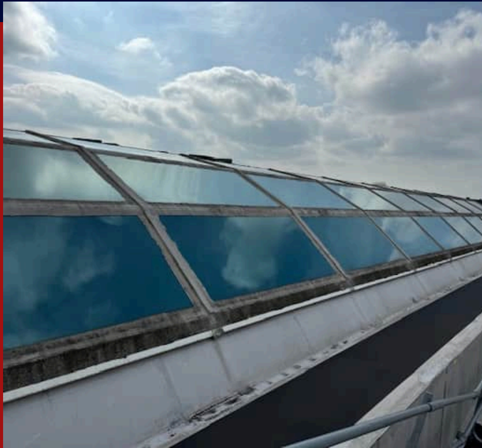
SIDE-ON VIEW OF OLD ATRIUM