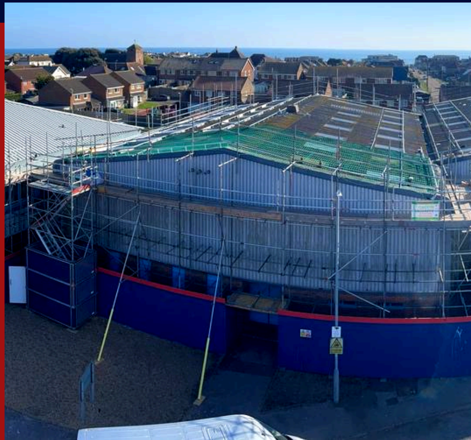
CONSTRUCTION & INSTALLATION OF OVER- SHEETING