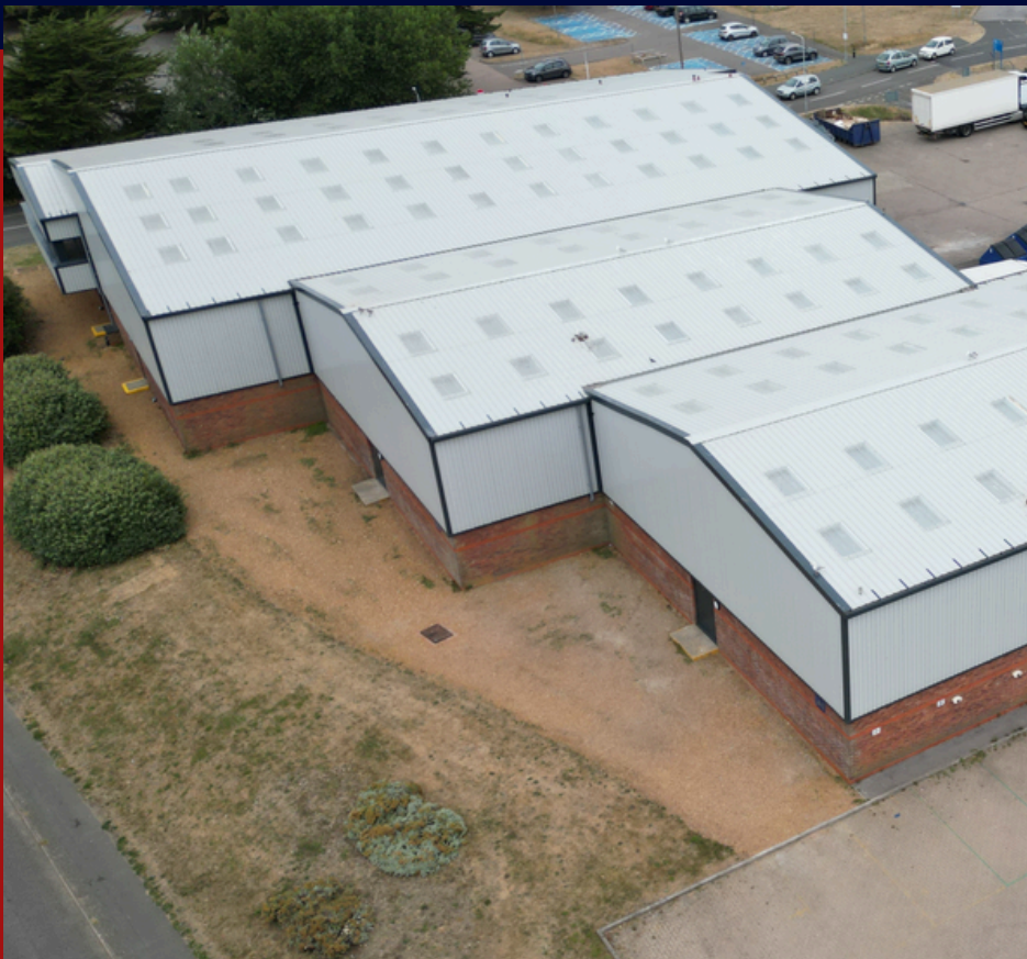
REAR OF BUILDING COMPLETION