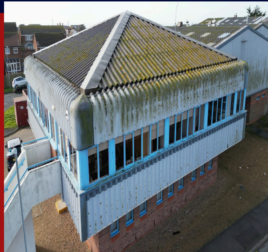
WINDOW TRIMS PRIOR TO BEING COATED IN ANTHRACITE