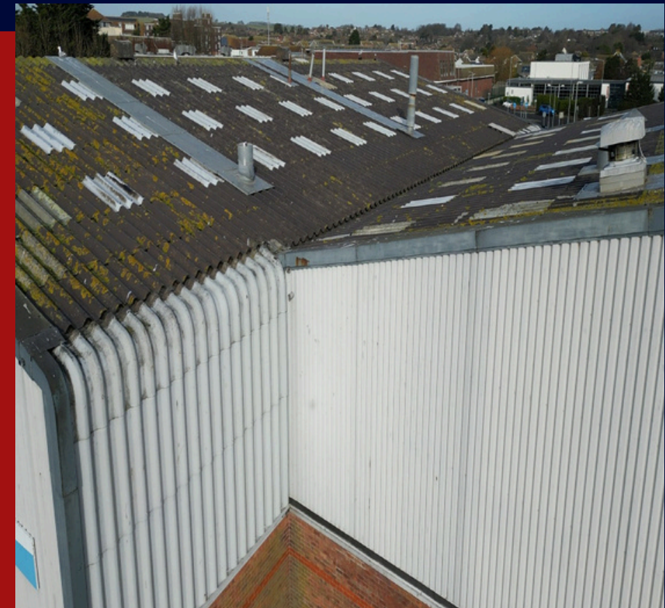
VERTICAL CLADDING WITH FLOW CLAD AND INTERNAL GUTTER