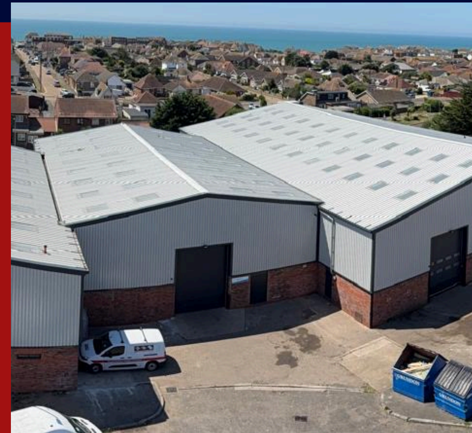
FRONT ELEVATION (AFTER)