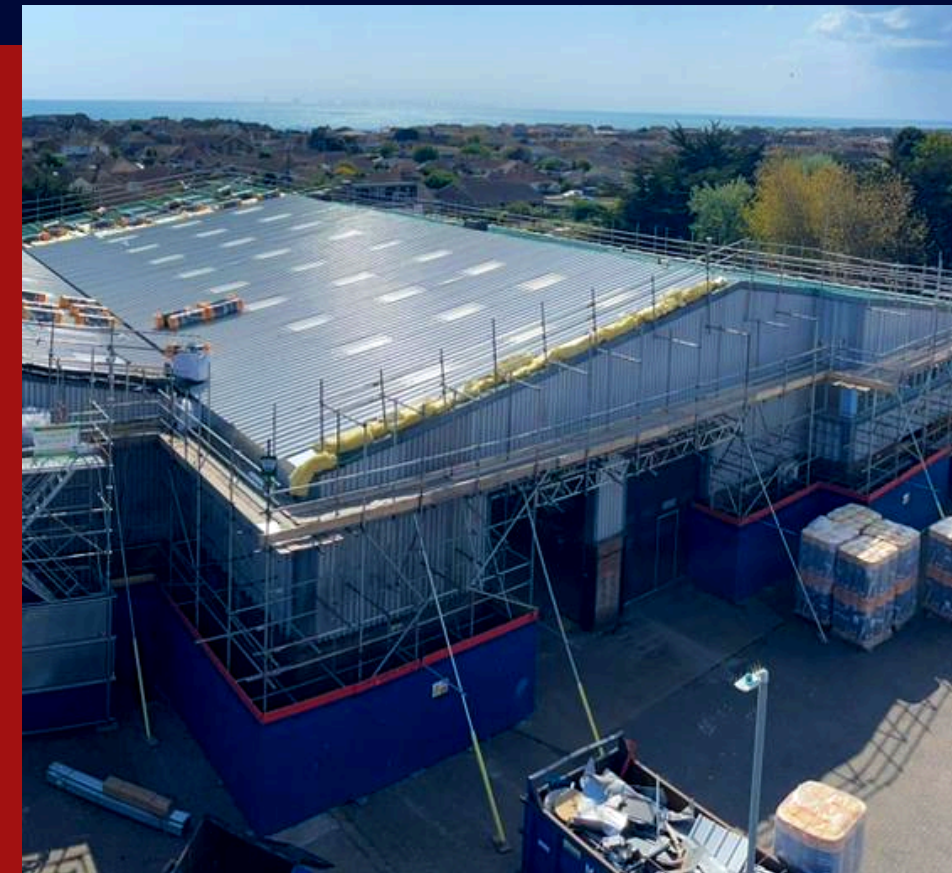
ROOF OVER-SHEETED WITH JORISIDE 32/1000 HPS200