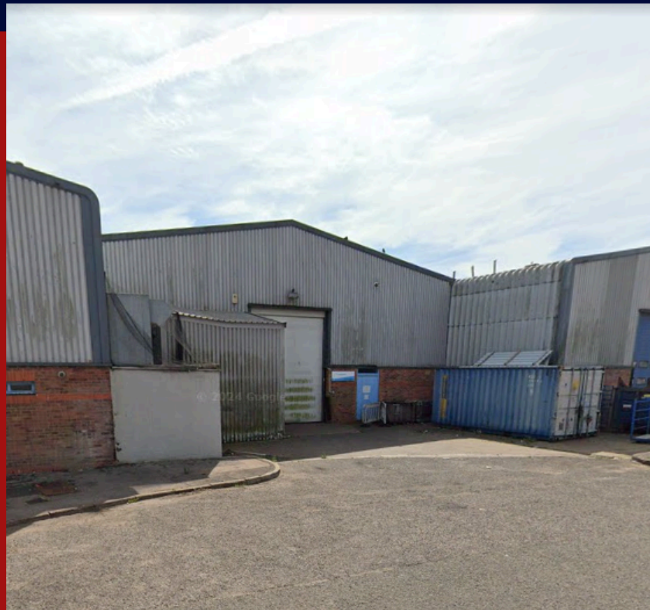
FRONT ELEVATION (BEFORE)