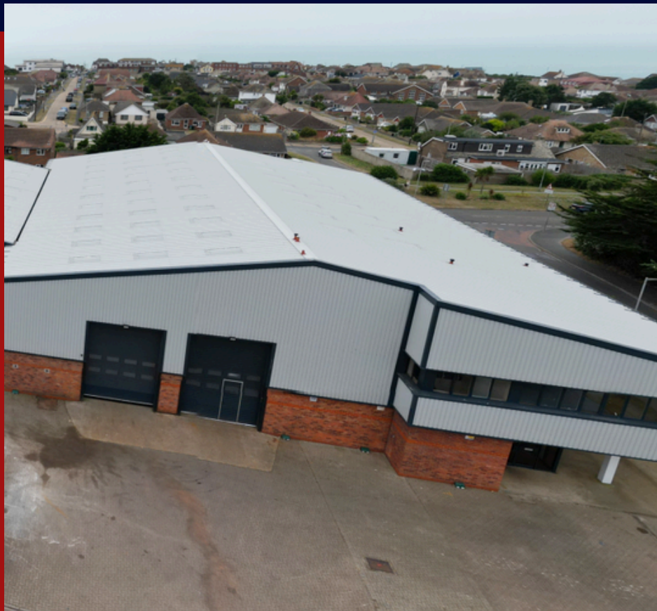
FRONT OF BUILDING COMPLETION