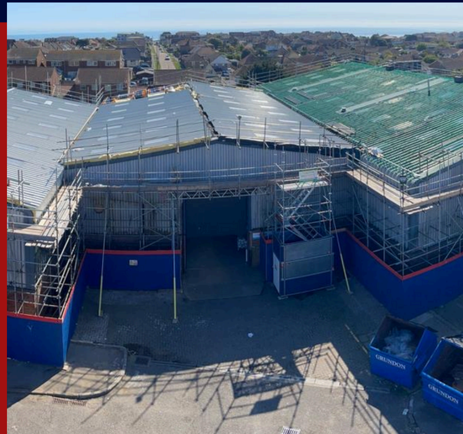
PART-COMPLETION OF OVER- SHEETING