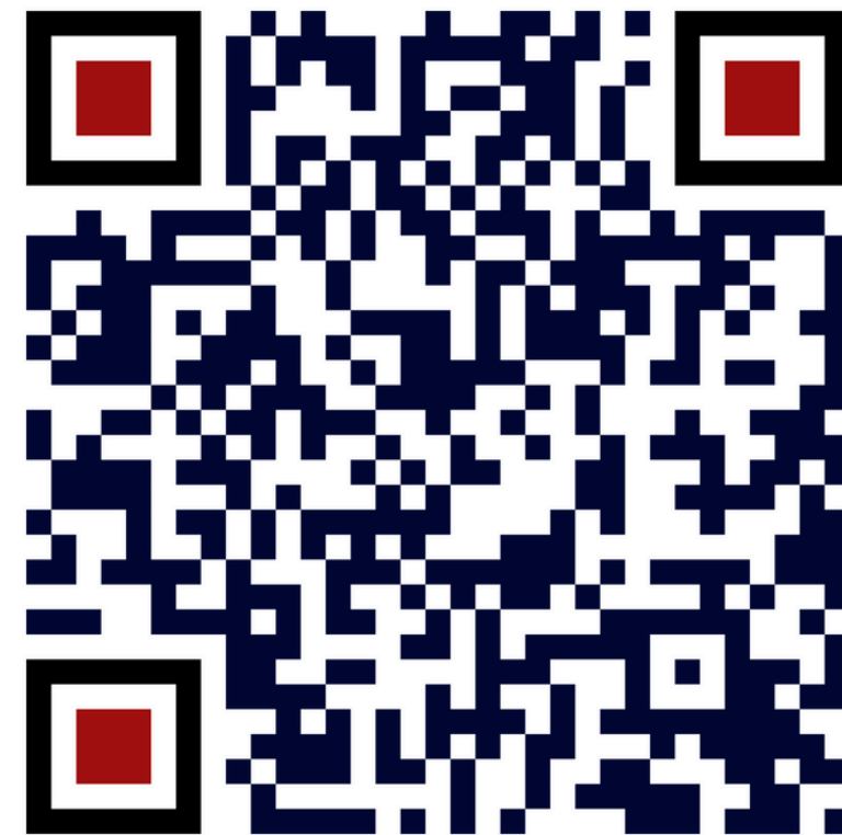
SCAN QR TO VIEW PROJECT