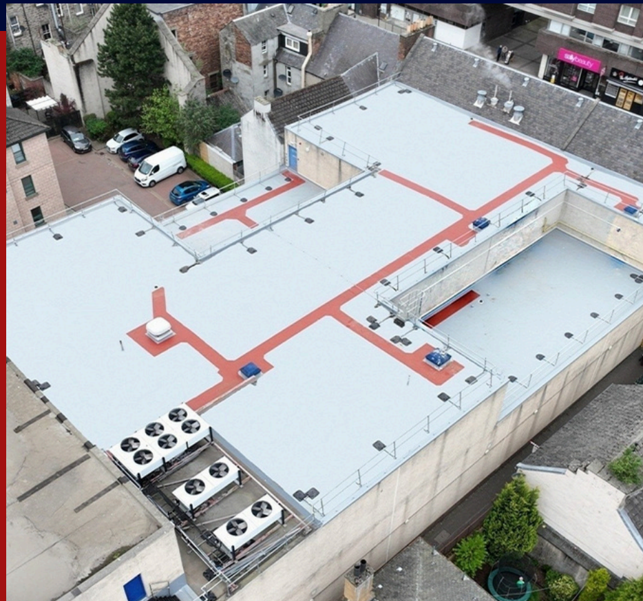
OVERVIEW OF COMPLETED WORKS