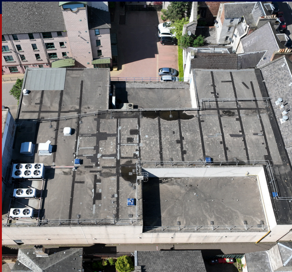
OVERVIEW OF EXISTING ROOF