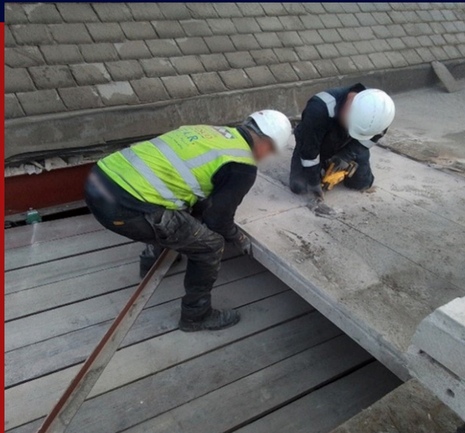
REMOVAL OF EXISTING RAAC PANELS