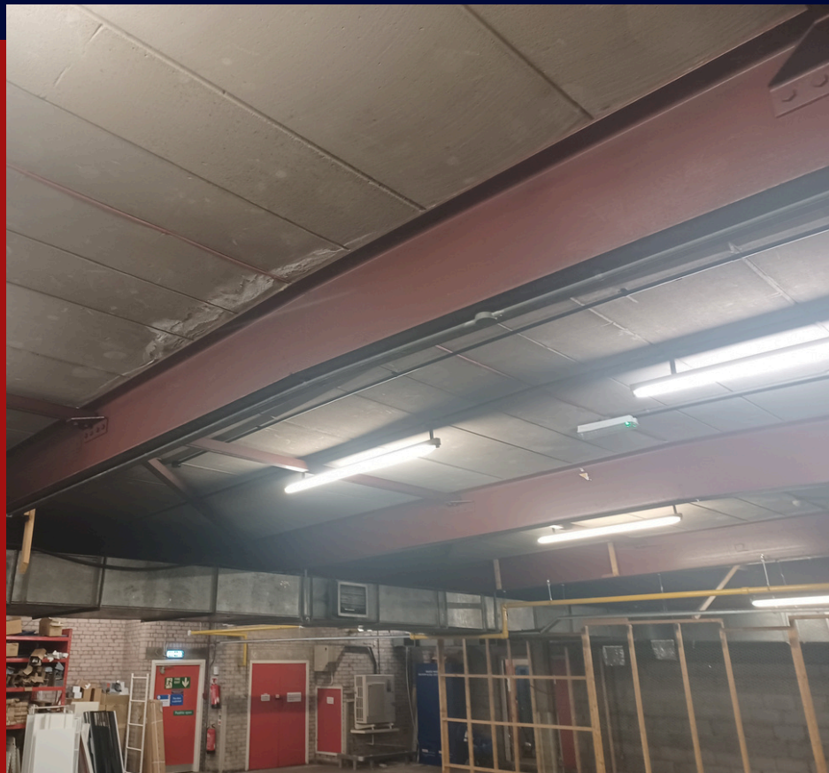
INTERNAL VIEW OF DAMAGED RAAC PANELS WITHIN WAREHOUSE AREA