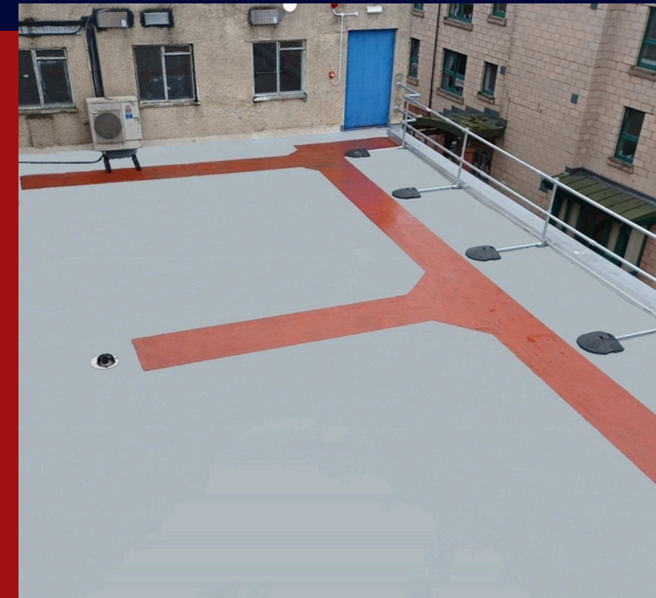
ANTI-SLIP WALKWAYS & EDGE PROTECTION PROVIDES SAFE MAINTENANCE ACCESS