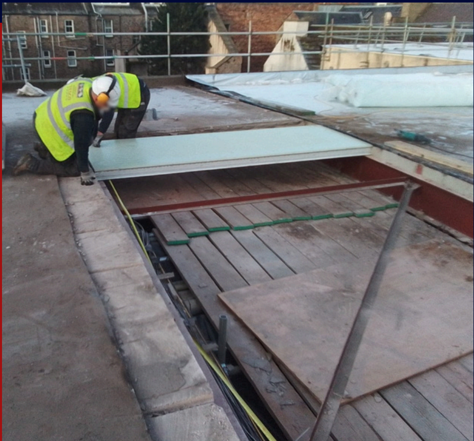
INSTALLATION OF NEW COMPOSITE DECKING PANEL