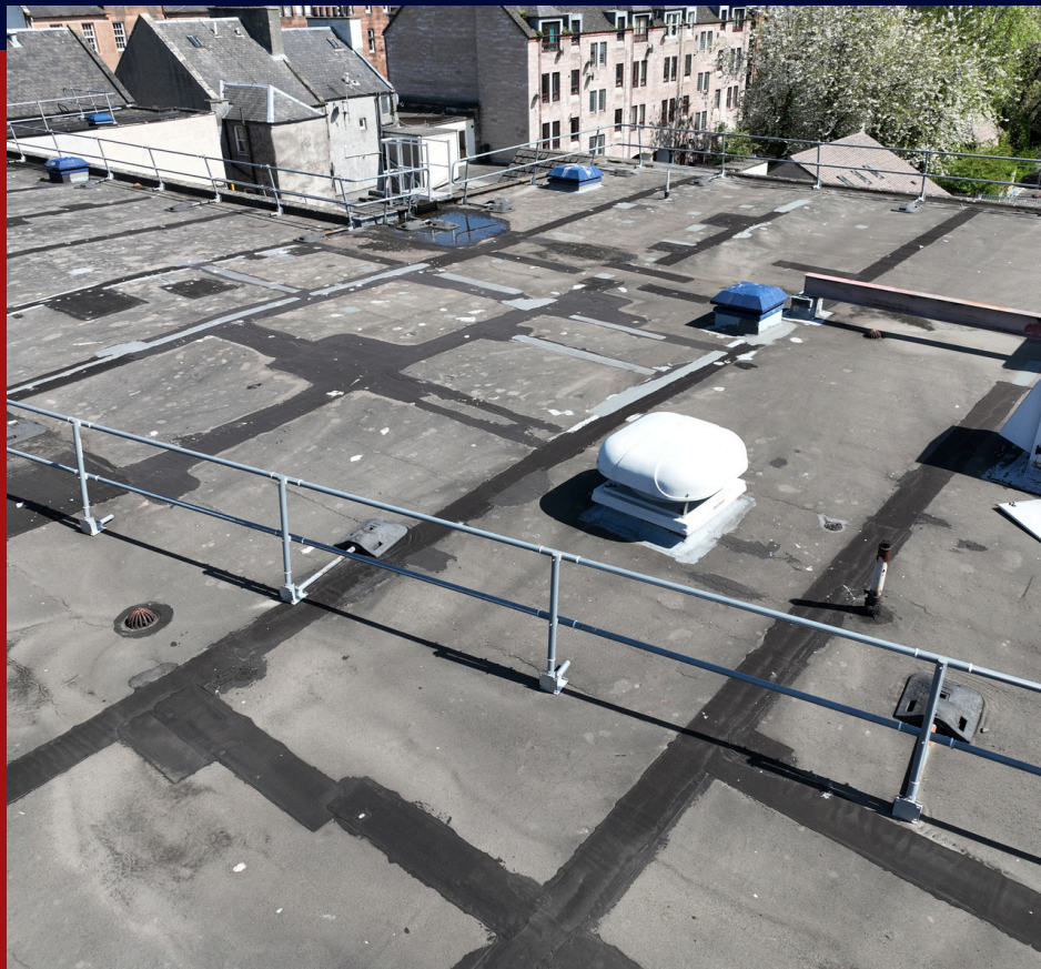
EXISTING ROOF COVERINGS WERE AGED AND WORN