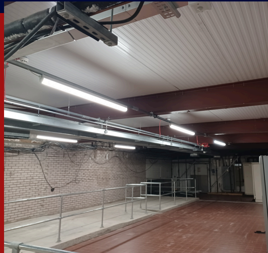
INTERNAL VIEW OF NEW DECKING PANELS