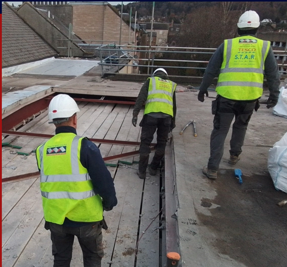
PREPARATION FOR COMPOSITE DECK INSTALLATION