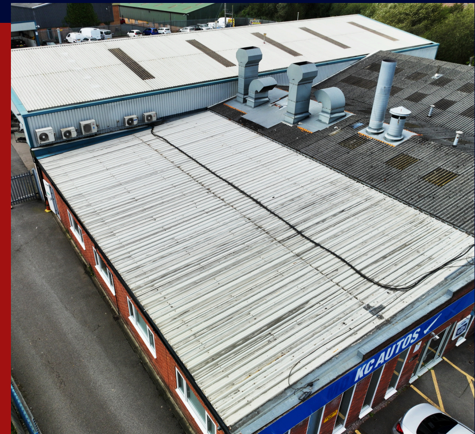
OFFICE ROOF AREA