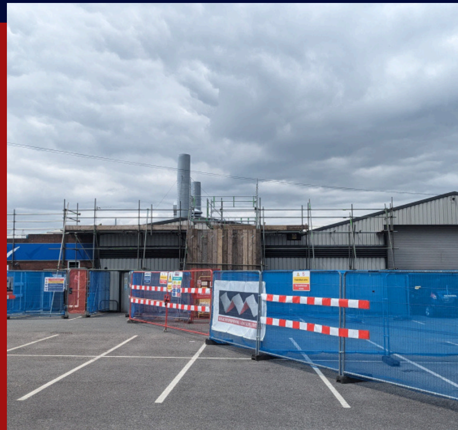
SITE SET-UP (GROUND)