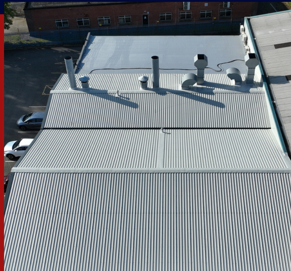
SPRAY ROOF & OFFICE ROOF COMPLETED