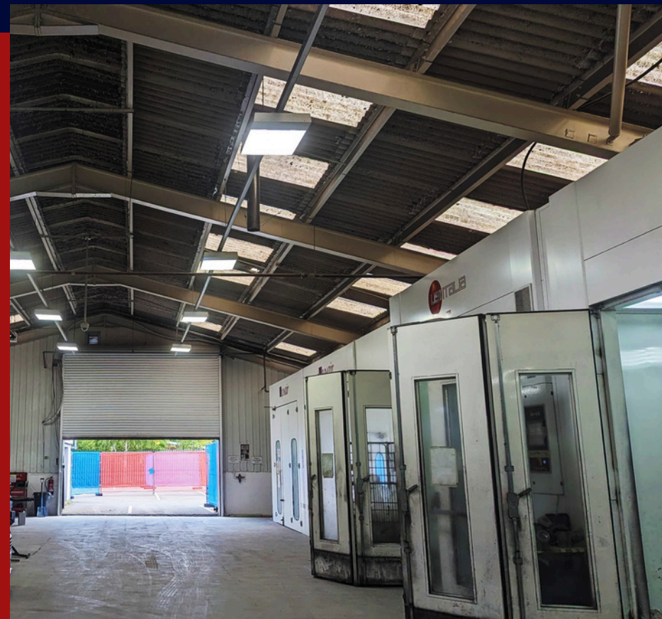
INTERNAL SPRAY AREA