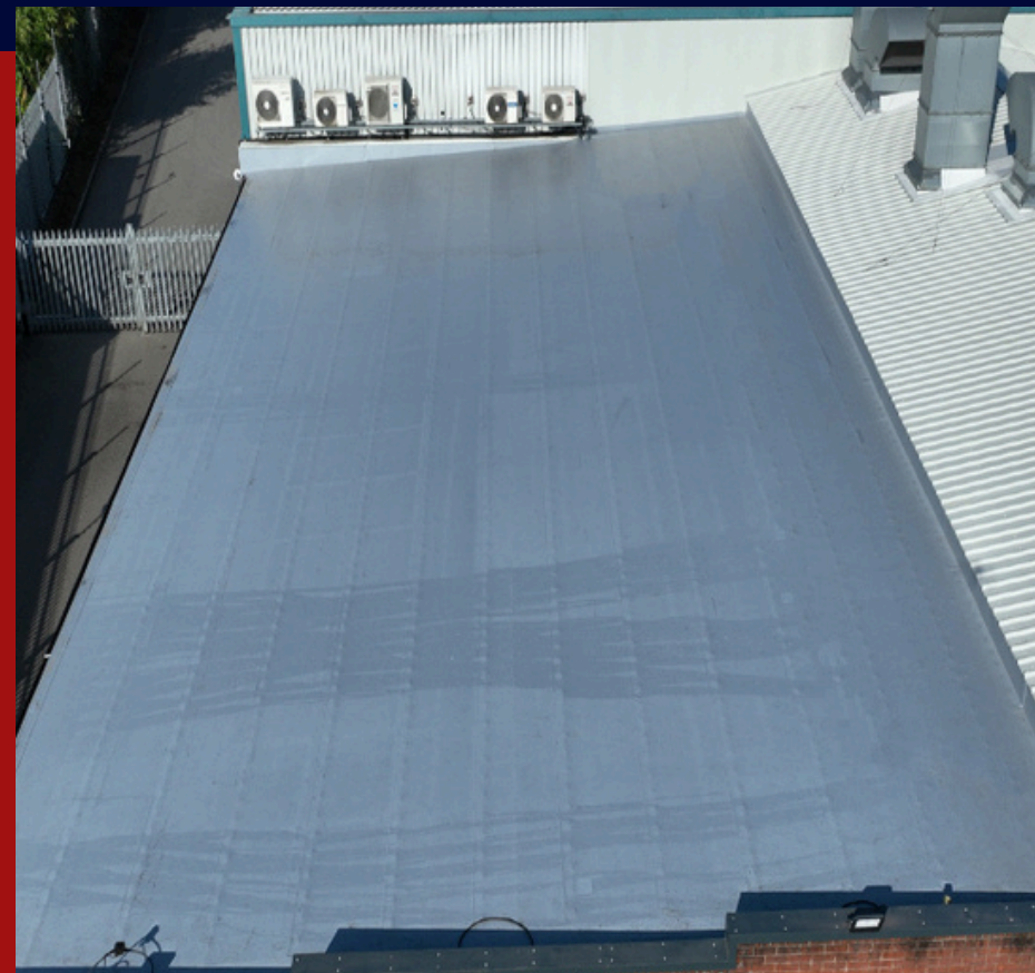
OFFICE ROOF COMPLETED