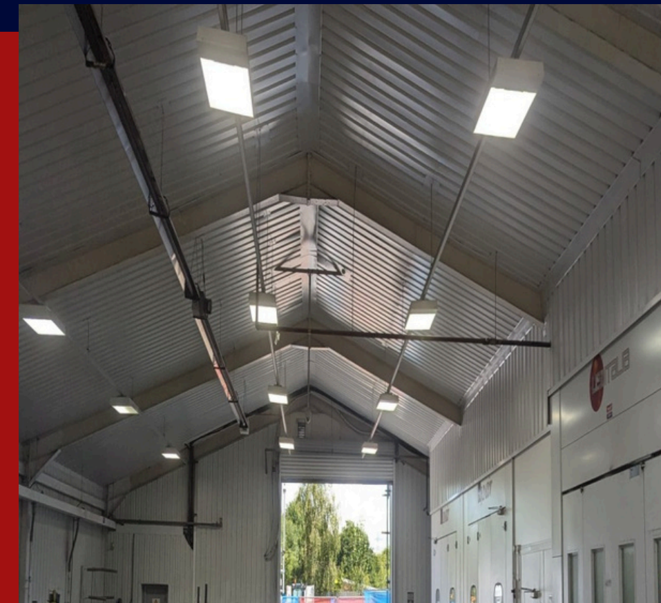
INTERNAL LINING COMPLETED