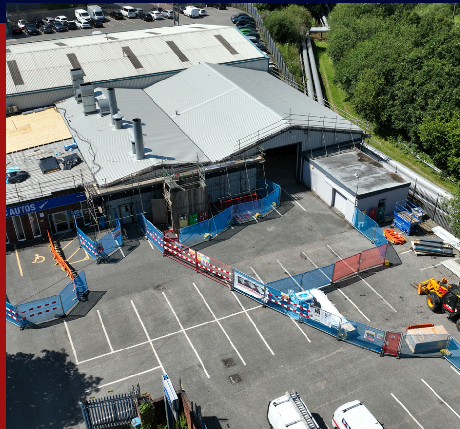
SITE SET-UP (OVERVIEW)