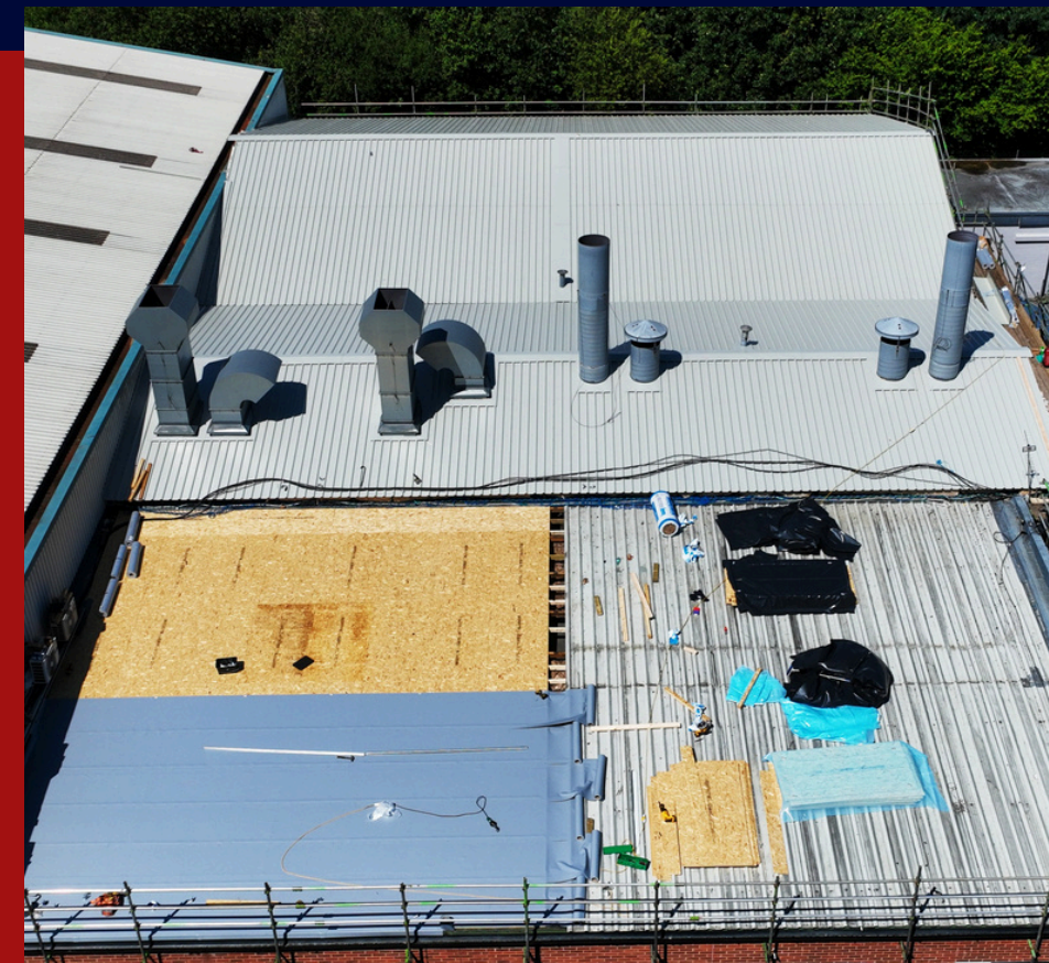
OFFICE ROOF AREA