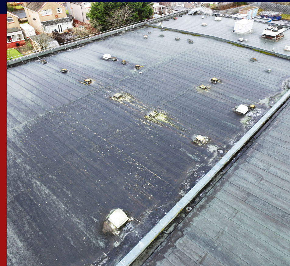
OVERVIEW OF ROOF SHOWING REDUNDANT VENT UNITS