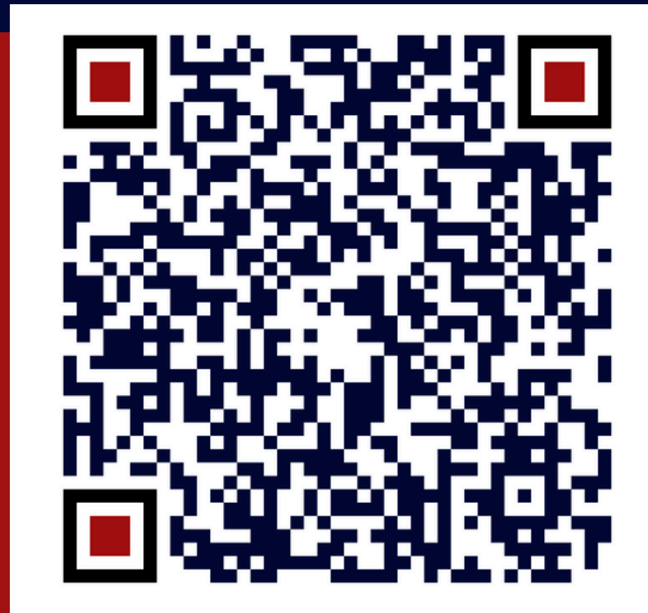
SCAN QR CODE TO VIEW PORTFOLIO