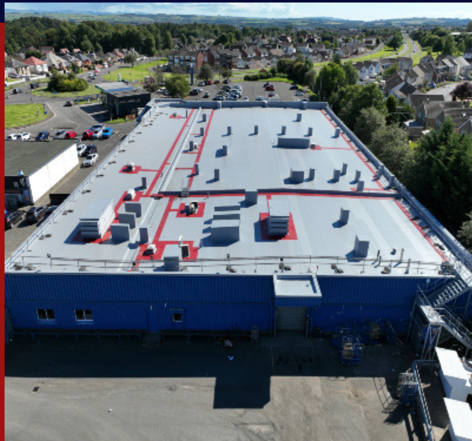
OVERVIEW OF COMPLETE WORKS