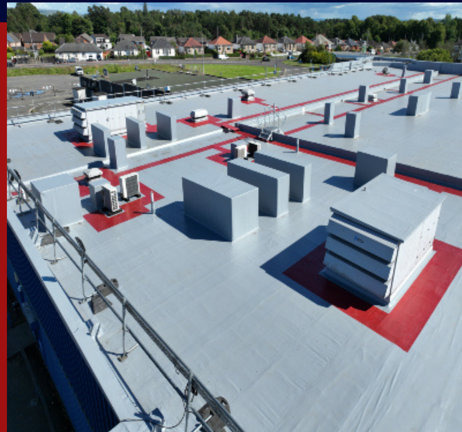
WALKWAYS AND BOXED UNITS