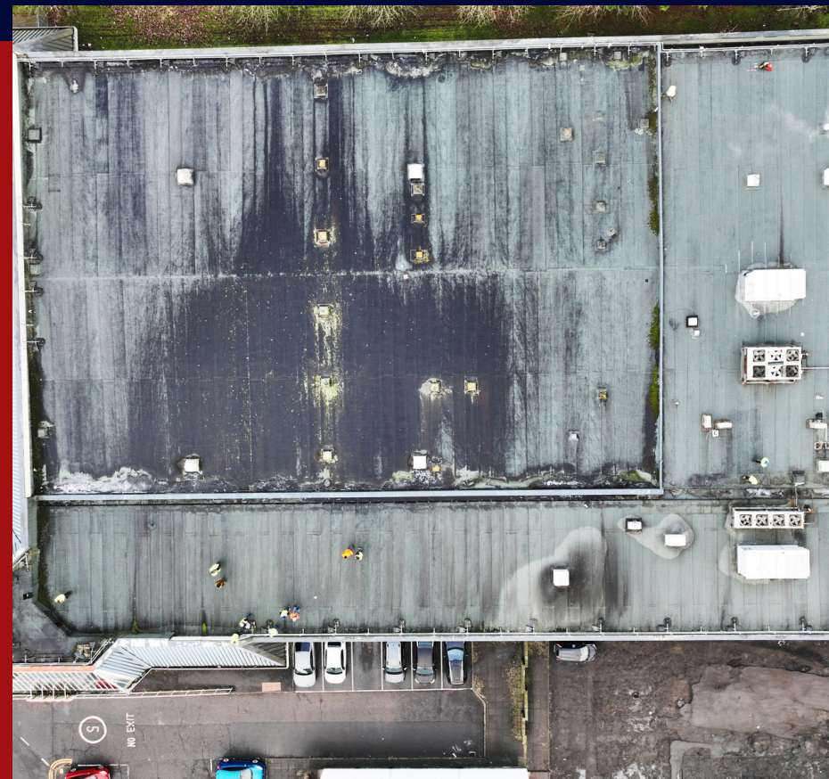
EXISTING ROOF COVERINGS WERE AGED AND WORN