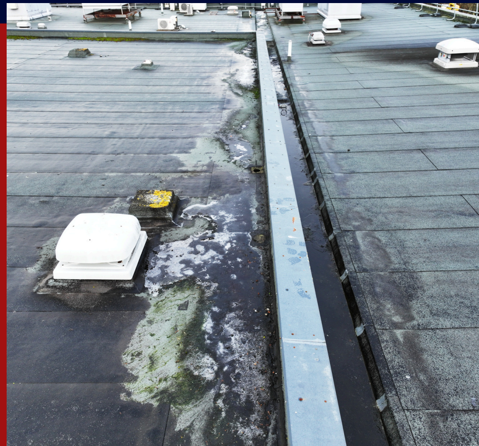
EXISTING FELT ROOF GUTTER DETAIL