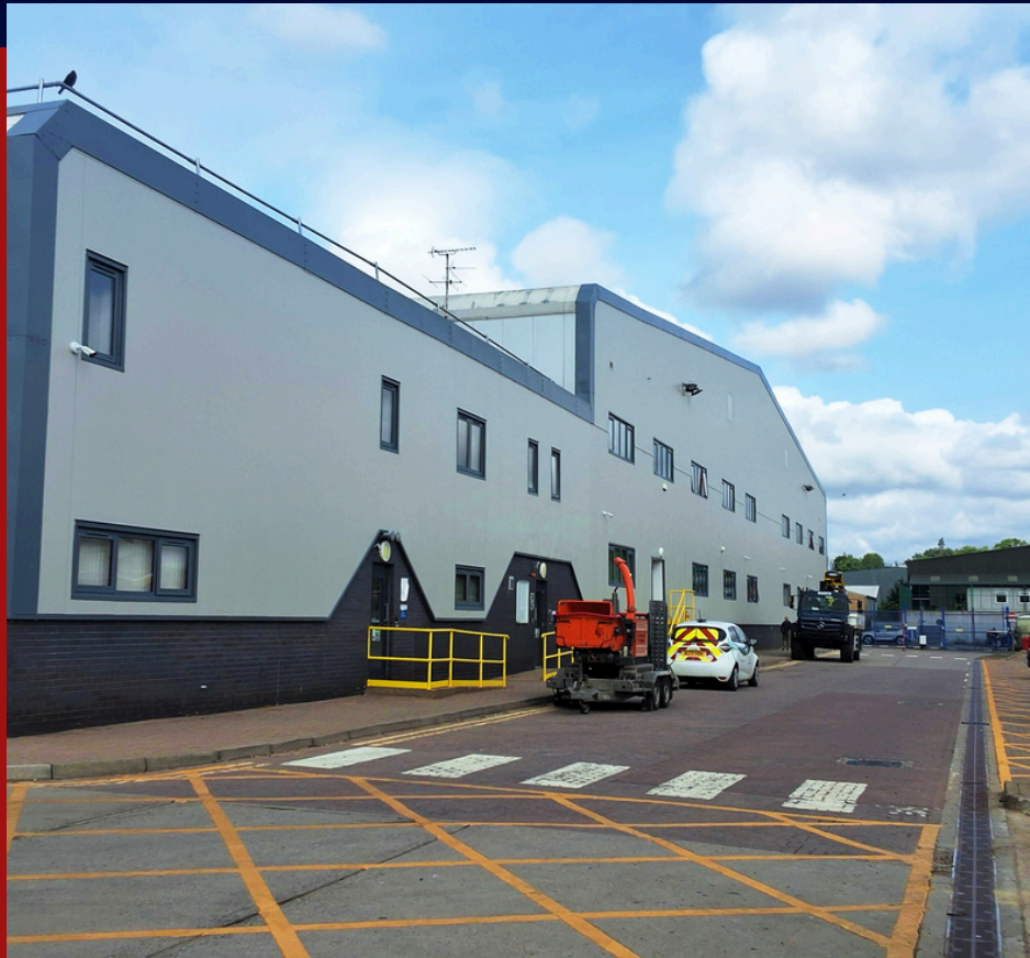
COMPLETED WORKS SHOWING WINDOW AND FLASHING DETAILS