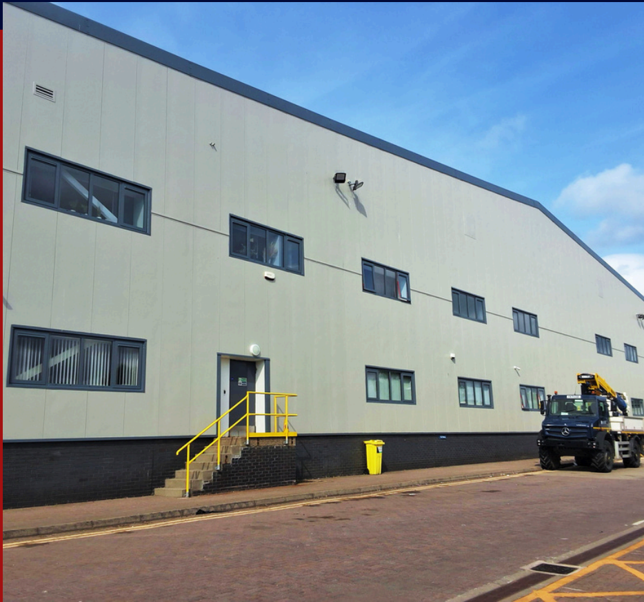
COMPLETED WORKS SHOWING WINDOW AND FLASHING DETAILS