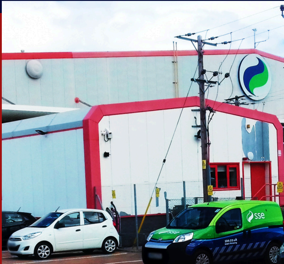
DELAMINATION OF EXISTING COATINGS