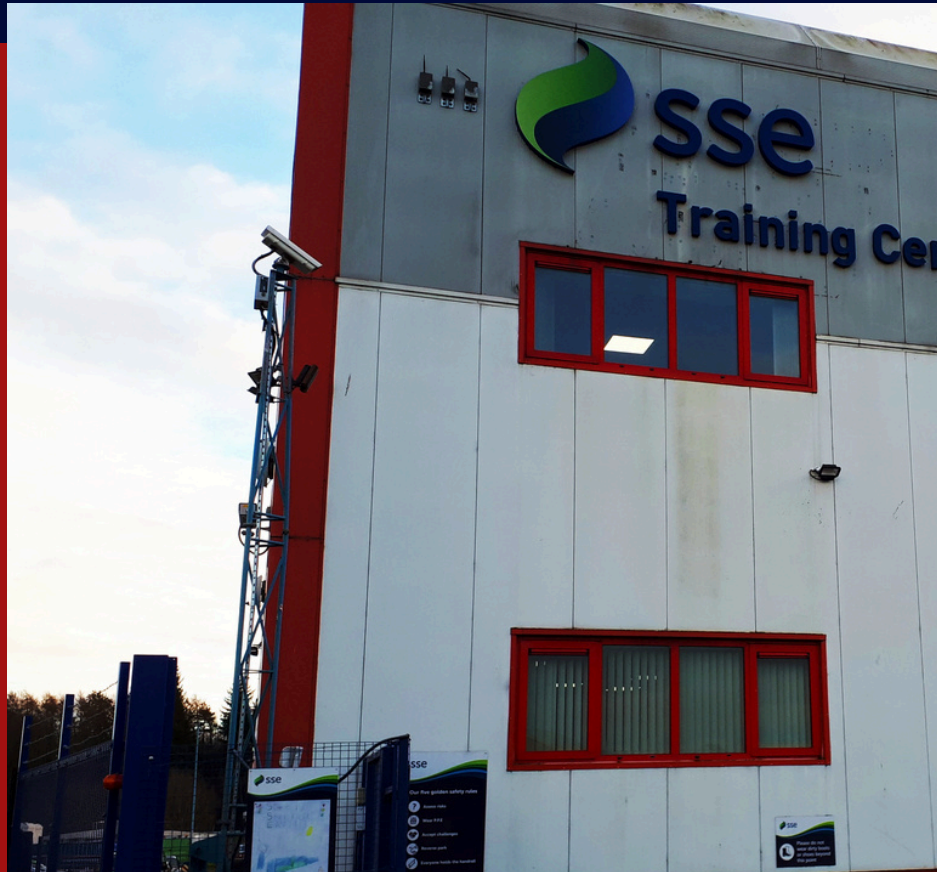
FADING AND DISCOLOURING OF EXISTING COATINGS