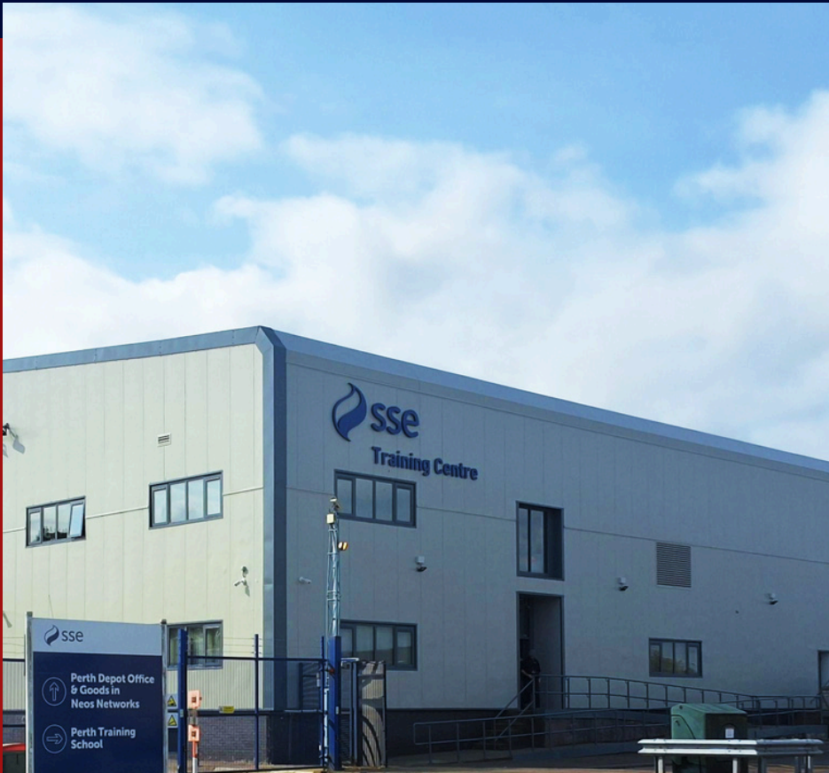
COMPLETED WORKS SHOWING WINDOW AND FLASHING DETAILS