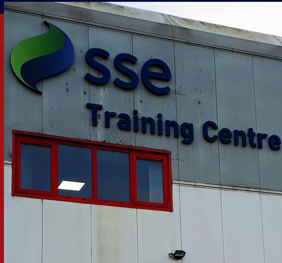
SIGNAGE BEFORE REFURBISHMENT WORKS