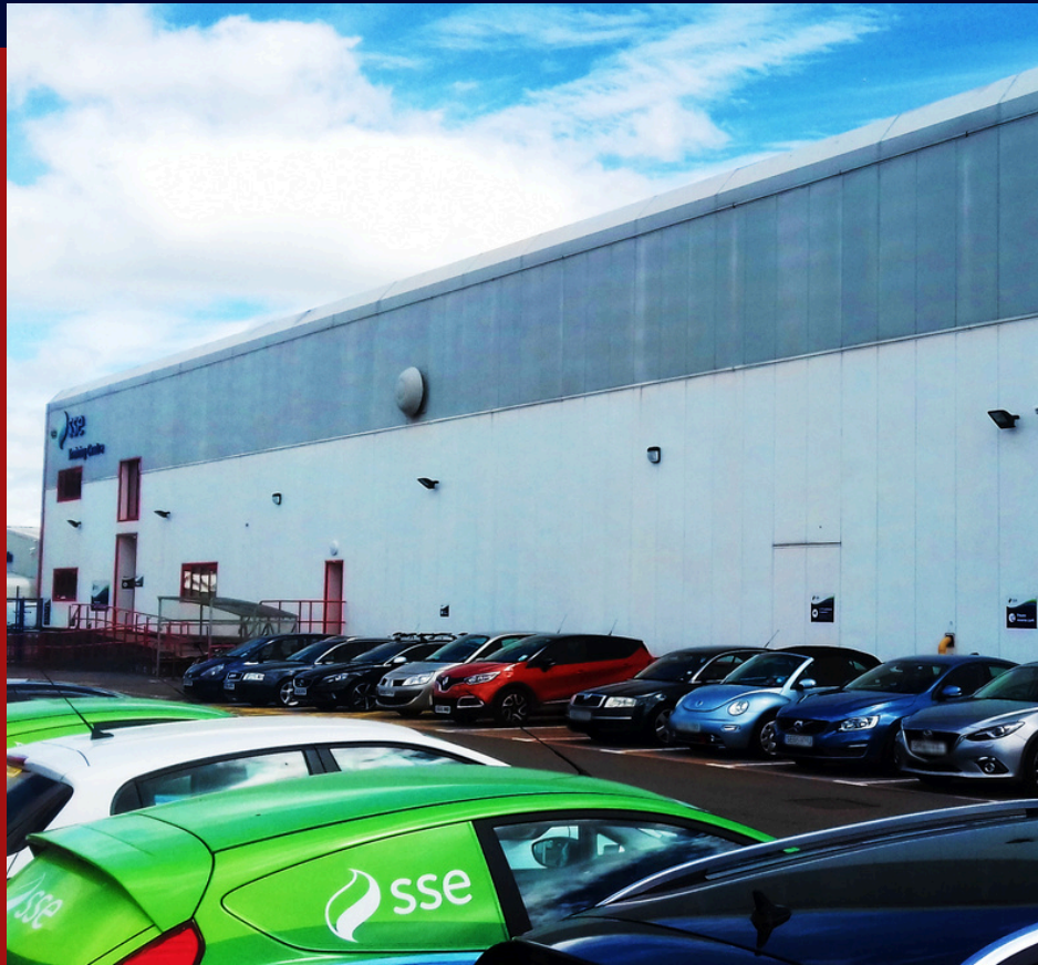
DELAMINATION OF EXISTING COATINGS