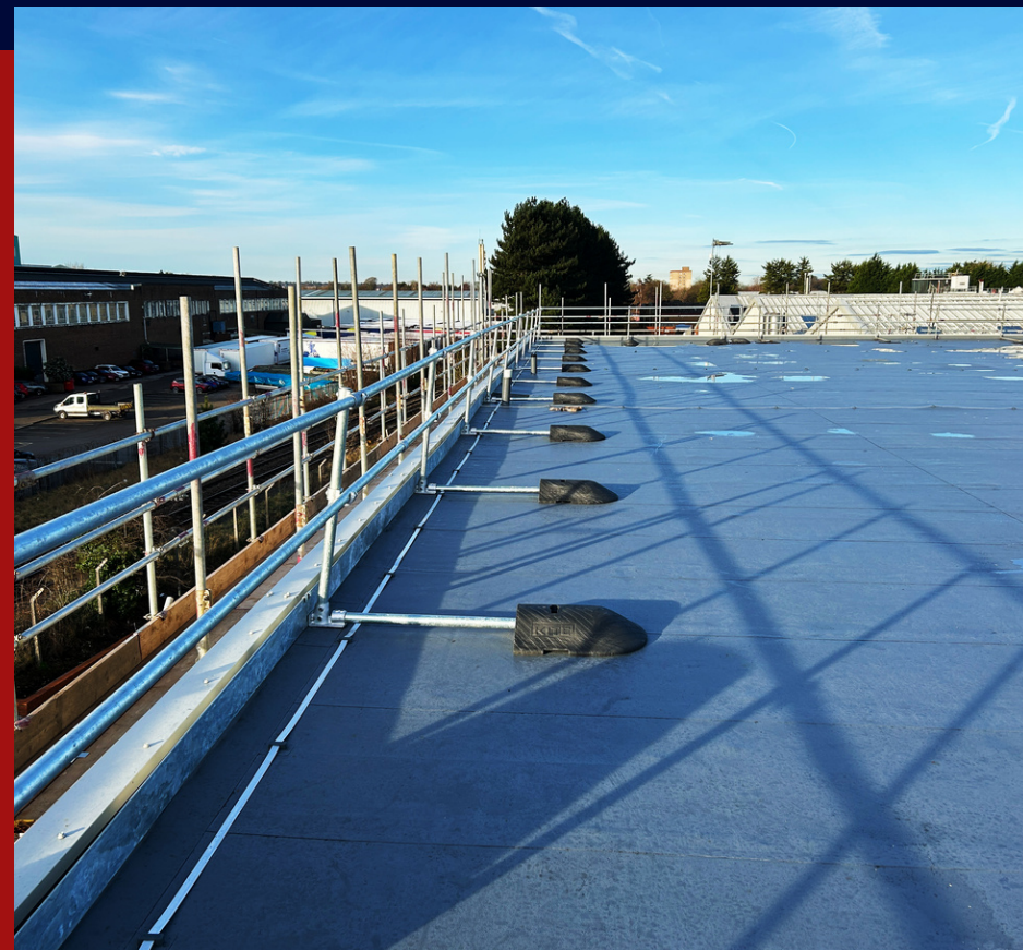
A SECTION OF THE FINISHED ROOF WITH A NEW PERMANENT HANDRAIL INSTALLED