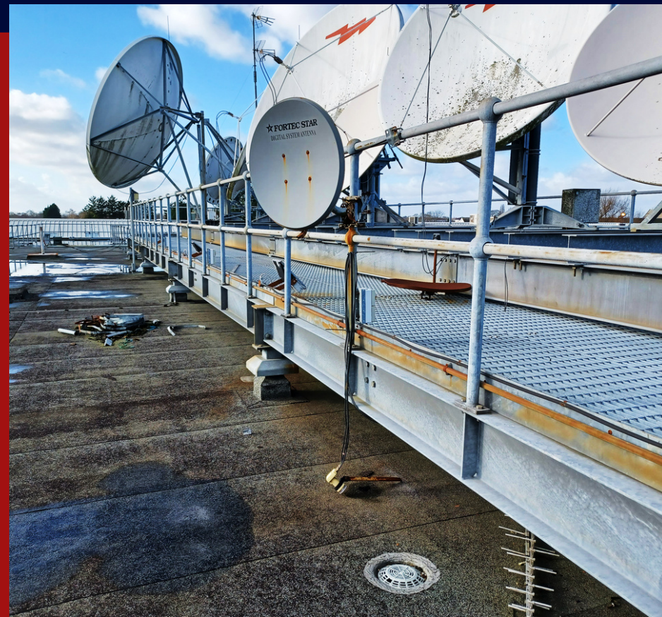
REDUNDANT ROOF-MOUNTED EQUIPMENT WHICH WAS REMOVED AS PART OF THE WORKS.