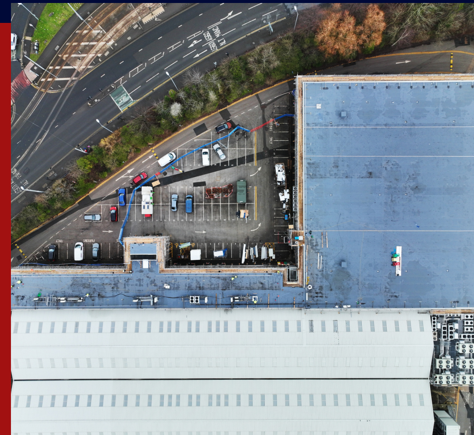
OVERVIEW OF THE ROOF SHOWING THE COMPLETED AREA.