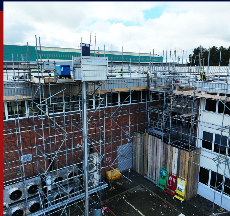
EXTENSIVE SCAFFOLD AND SAFE ROOF ACCESS BY WPA SCAFFOLD.