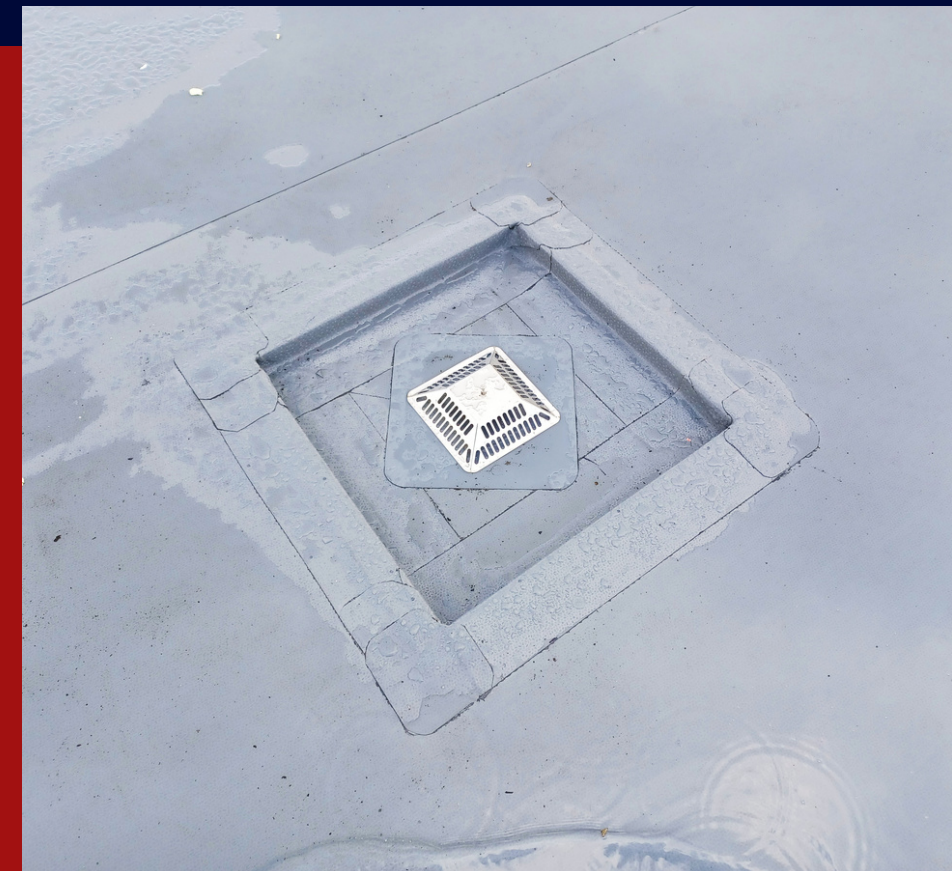
RAINWATER OUTLET DETAIL INSTALLED TO THE MANUFACTURER'S SPECIFICATION.