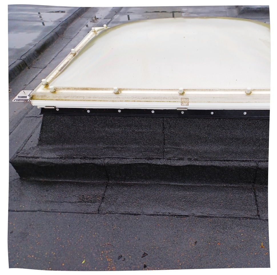
Following WPA works, particular focus on the correct detailing of all penetrations.