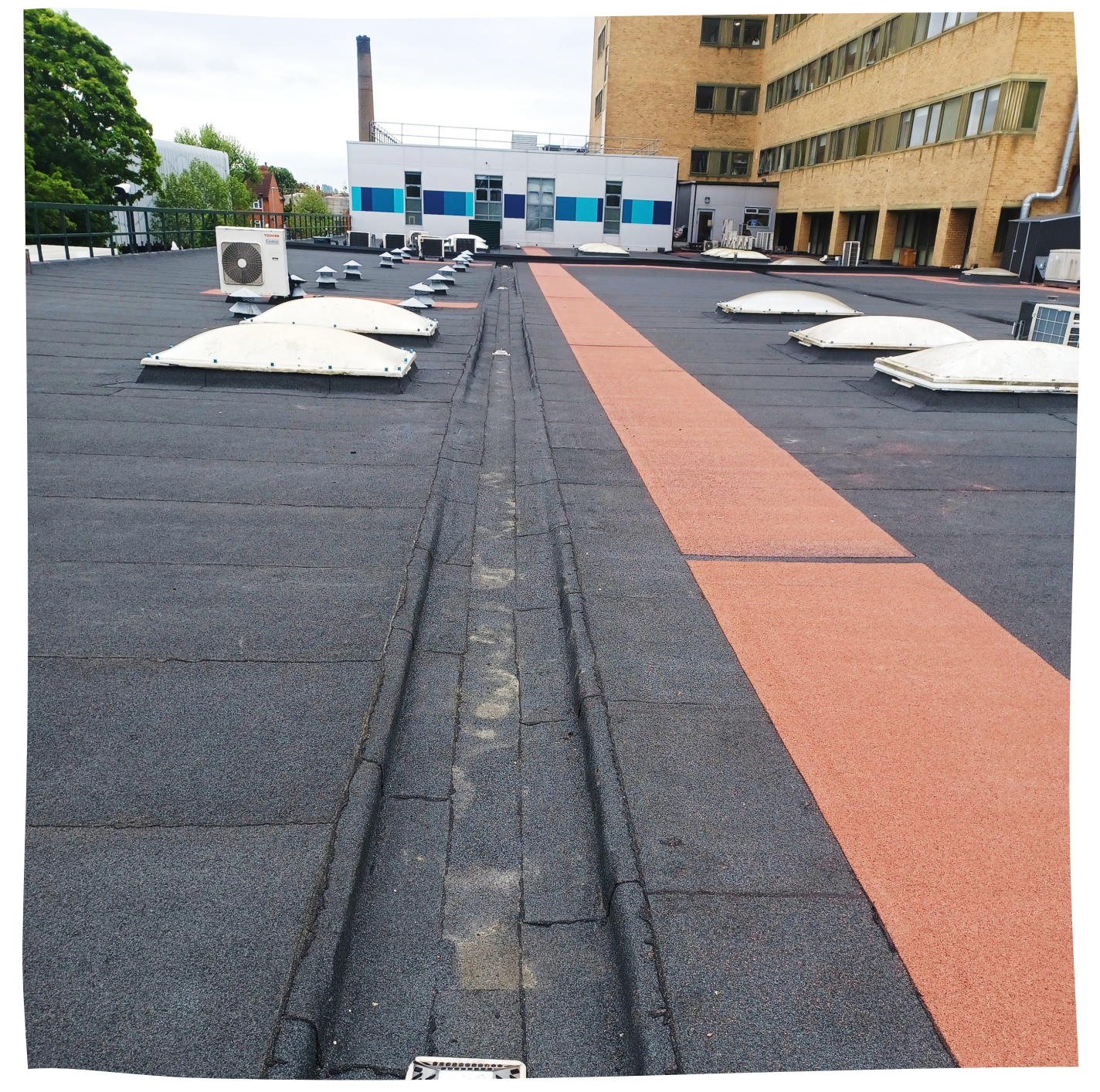
Overview of the roof following works, sumped gutter and clearly demarcated walkway.