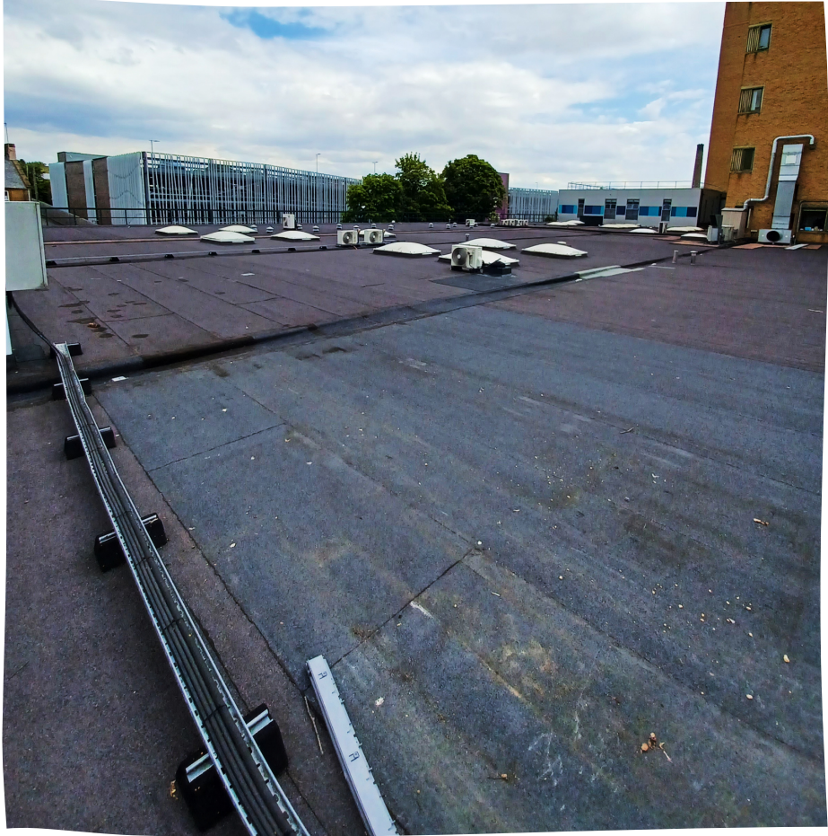
Before works, the image shows the condition of the felt, blisters, and failed laps.