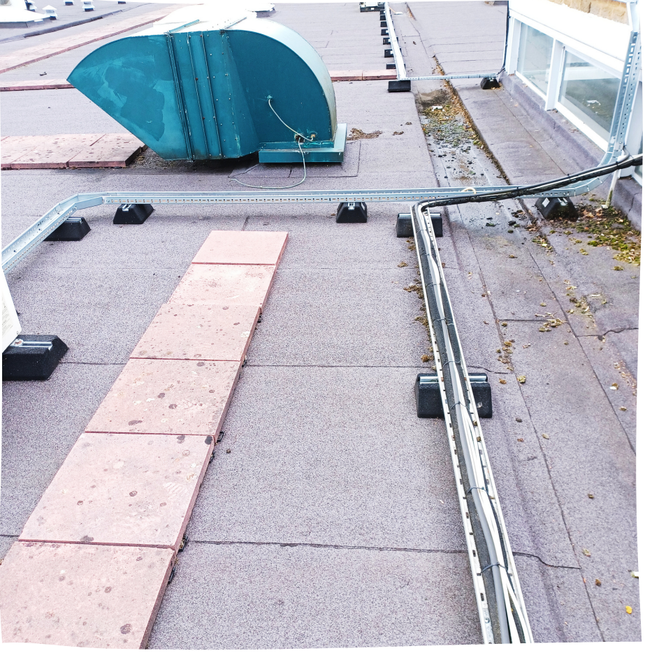
Before works, paving slabs used to demarcate a walkway on the roof