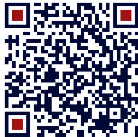
Scan the QR code to view online.