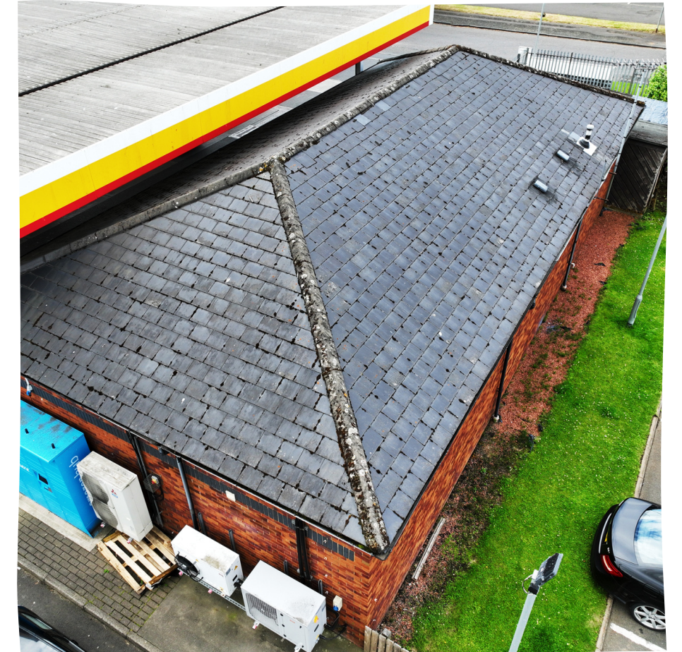
Existing roof covering