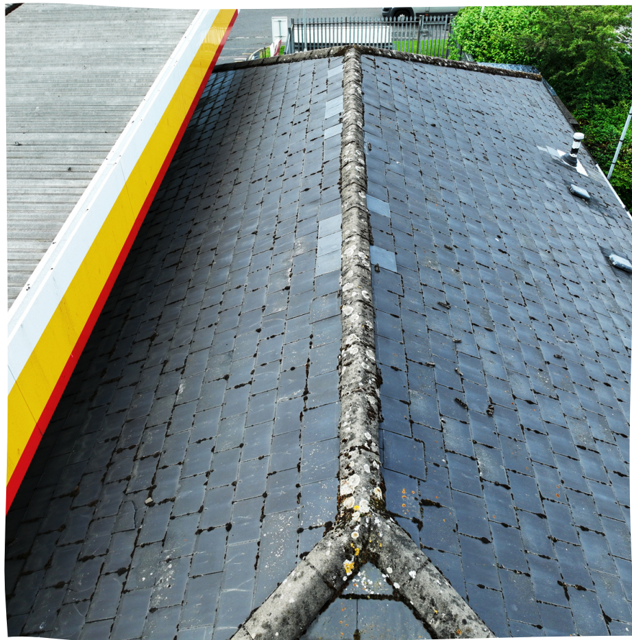
Existing roof covering