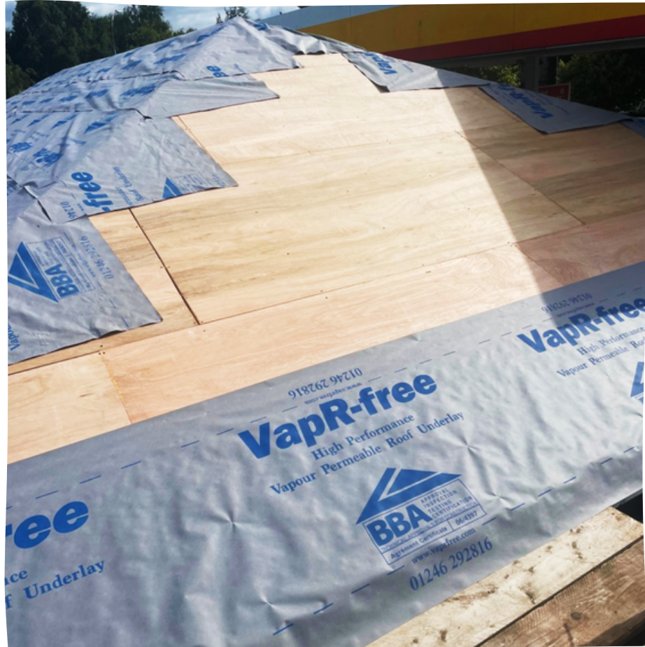
Installation of marine-grade plywood following tile removal