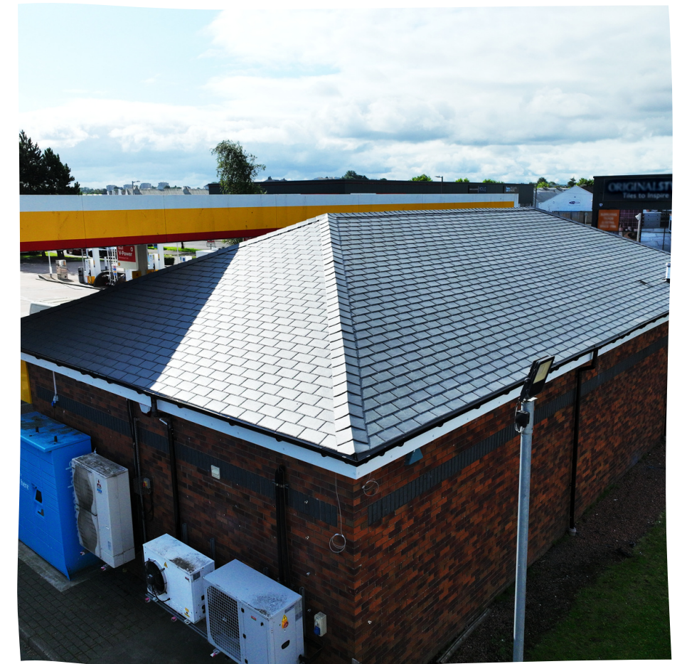
New fascias, soffits and rainwater goods