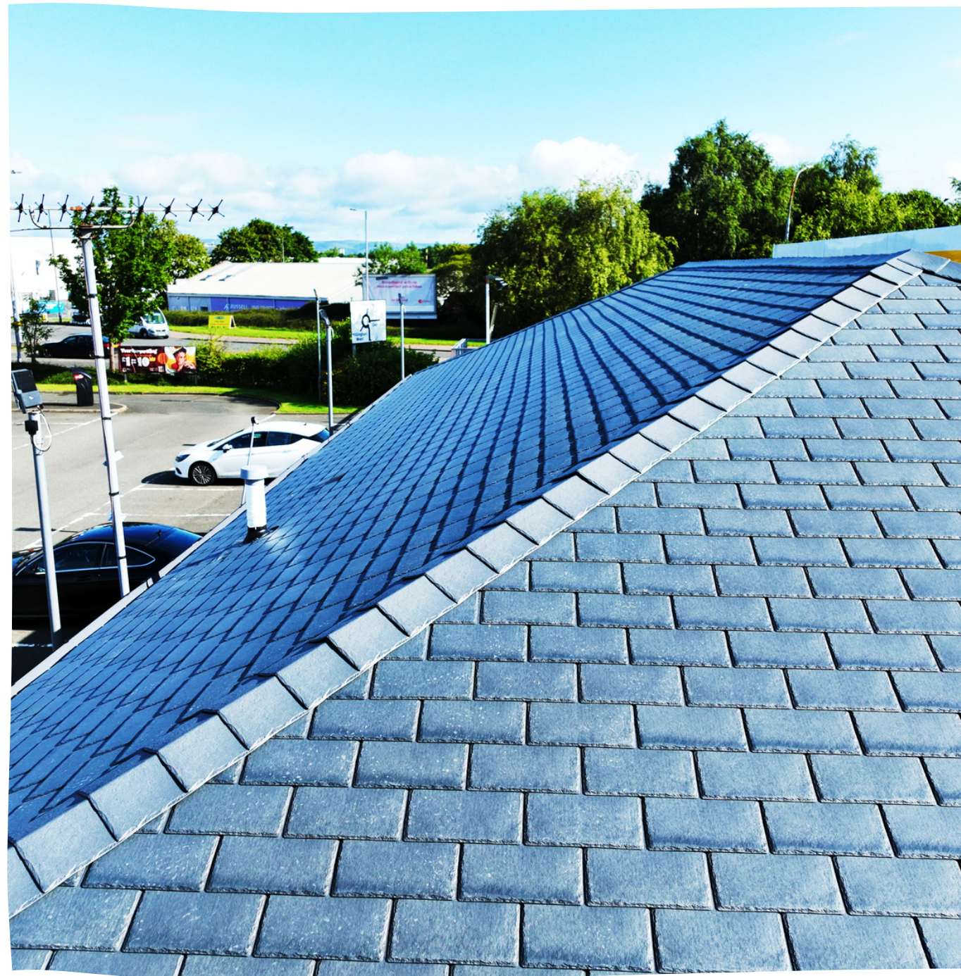
New Britmet Liteslate system