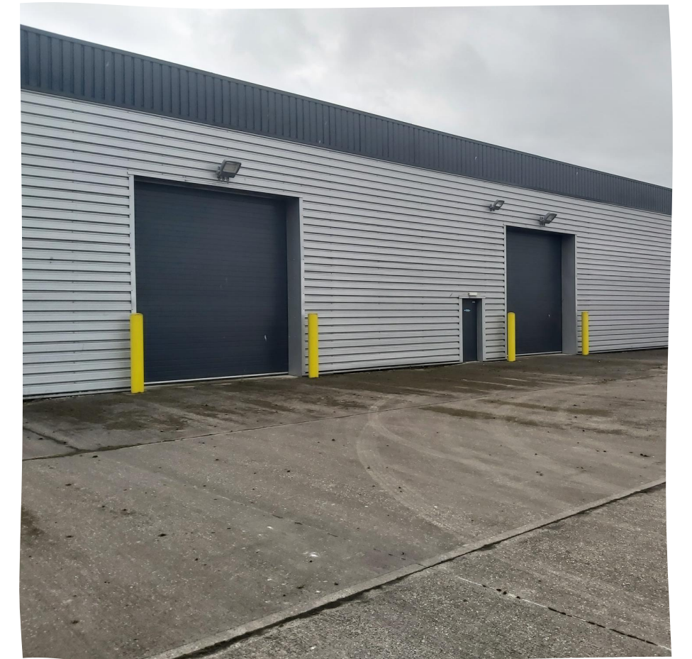
Top Left – Image of before cross-sectional doors were installed Bottom Left – Internal view of the new cross-sectional doors Bottom Right – Before shot of external elevation prior to works Top Right – Painted offices and cleaned office space Main Picture – Installation of new lighting and floor clean